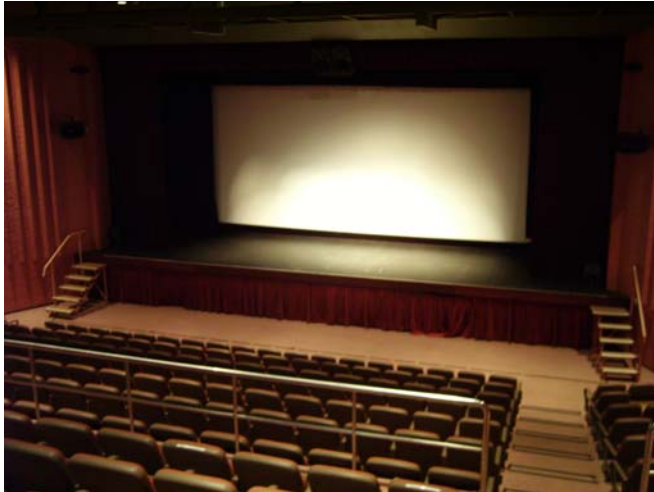
Photo taken while cinema screen onstage