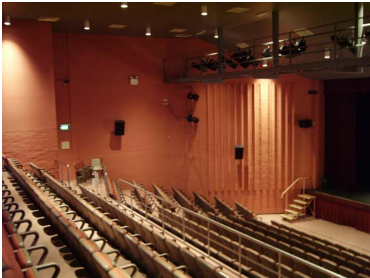
Shows FOH lx gantry and side booms